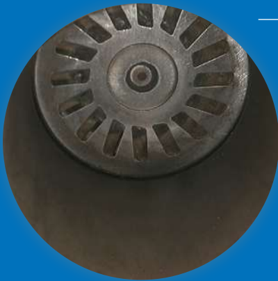
7FA Igniter (Oil & Gas)

Detect even the smallest indications in a variety of applications across a range of industries, including: