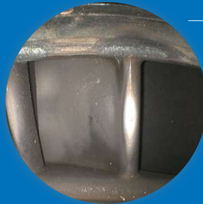
Nozzle crack in a turbine (Aerospace)