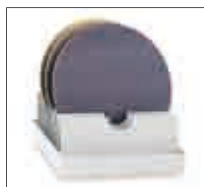
Draining for plates storage