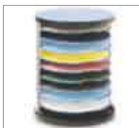
Storage rack for your consumables