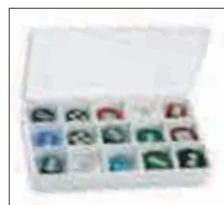
Specimen storage box