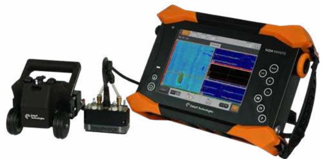
Play/Pause/Increment buttons to use with Eddyfi scanners