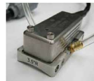
Curved ported wear bars