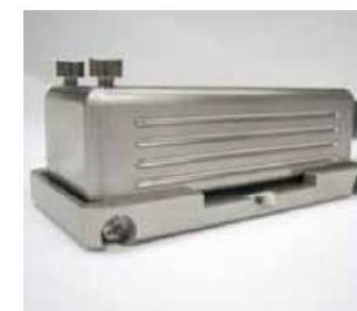
Flat ported wear bars